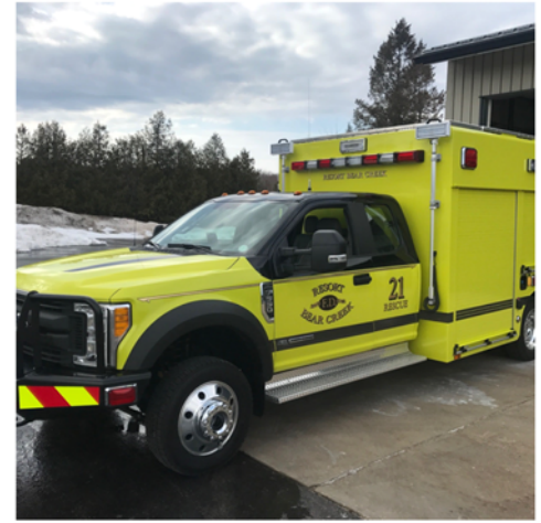
RBCFD's new rescue truck

The Resort/Bear Creek Fire Department provides fire protection for the northern portion of the Township. Chief Al Welsheimer reported that the department has an average response time of 7.03 minutes for all incidents. The department responded to 16 calls in 2017 in Bay Township. There were 4 trash/yard waste fires, 1 downed power line, 4 false fire alarms, and 7 false fire alarms that were canceled by residents before equipment was dispatched. In comparison, the township had 24 calls in 2016. Chief Welsheimer also has informed us that the department purchased a new rescue truck.