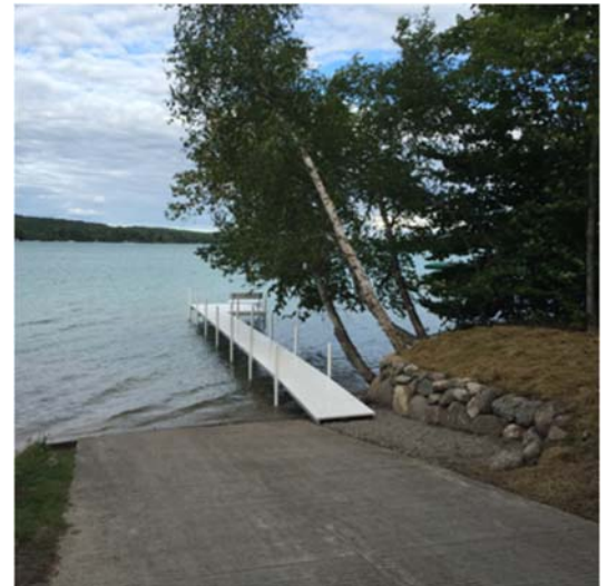
(Right) Sumner Road Lake End on Walloon Lake

Due to incidents of vandalism last year on the dock and the improvements at the Sumner Road Walloon Lake Access, Charlevoix County Sheriff Charles Vondra has instructed his department to increase road patrols at this busy summer road end. Bay Township spends money annually to provide safe and functional access for boaters and other lake users, and we are disappointed in the damage and vandalism that has been done to the dock and landscaping that your tax dollars have provided. If anyone has information that might lead to the identity of any person or persons responsible for these acts of vandalism, please contact the Charlevoix County Sheriff's Department at (231) 547-4461.