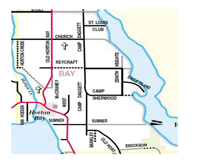
Figure 1. Map of Major Roads in Bay Township